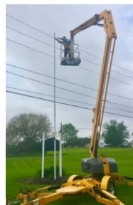
New rope for the flagpole