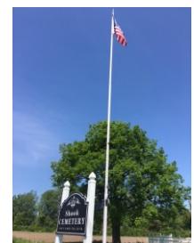
for Memorial Day

Summer Reading Summer Fun Take a look and find a book in The Lending Library!!