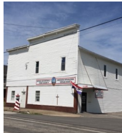
974 S. Lake Street, Gypsum